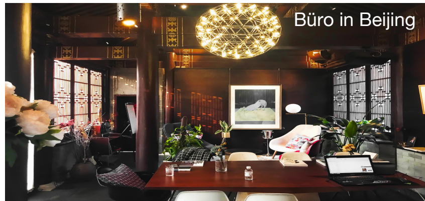
Büro in Beijing